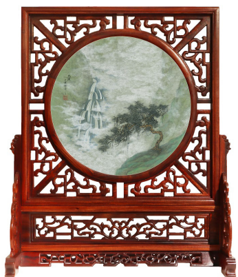
九渊之四十八 Nine Abysses XLVIII 2022 35cm Dia 57.5x48x19cm (Frame) Ink and Colour on Paper