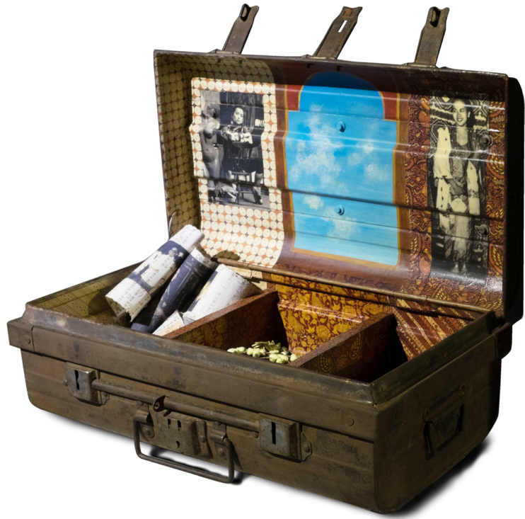
Still Strong In My Memory

2008 190 x 133 x 20 cm Mixed Media On Canvas