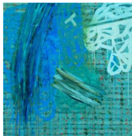
Left: Covered Up, 127 x 127 cm, Acrylic on Linen, 2011