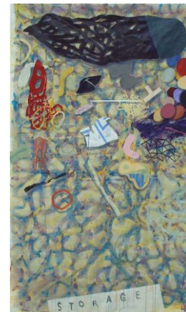
Right: Storage, 196 x 100 cm, Acrylic on Linen, 2009