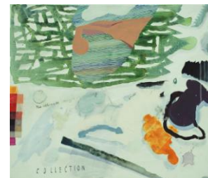
Right: Collection a, 59 x 70 cm, Acrylic on Canvas, 2009