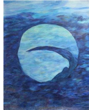
Lee Wen, This Blue Again, 2015, 150 x 123 cm Colour pencil on canvas

Exhibition period: 28 th October – 21 st November 2015 (open to public)