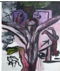
Crucifixion 1990 88 x 61 cm Acrylic on canvas

Lee Wen’s new paintings will officially premier at the exhibition opening itself.