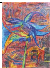
Flowers of Evil – Karachi 2014-2015 109.5 x 79 cm Colour pencil on paper

In the dark-coloured Prayala series (2002), the artist says, “The series of drawings were done with random scratches, scrawls and whorls, which find their own distinct form in the midst of chaos. Each mark is an echo of the previous one; each stroke makes a decomposition of the preceding composition. Style is generally equated with eccentricity, individuality and originality. These drawings are intended to move in the opposite direction, toward generality, anonymity.”