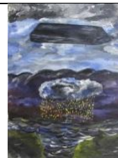
Hard Rain 1990 87 x 60 cm Acrylic on canvas