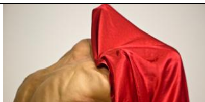
The Call of the Red